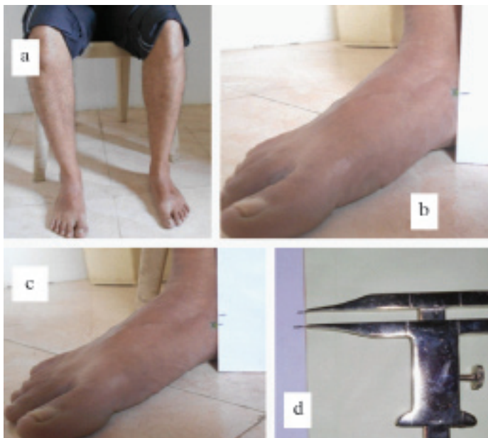
[Table/Fig-2]: Procedure for measurement of Navicular Drop for study participant; a) Subject in sitting position with hip and knee flexed at 90 degree and ankle in neutral position; b) Navicular height on an index card in sitting position (non weight bearing); c) Navicular height on an index card in standing position (weight bearing); d) Measurement of Navicular Drop by using Vernier caliper.

of each participant were recorded. The ND was measured applying Brody Method [3].